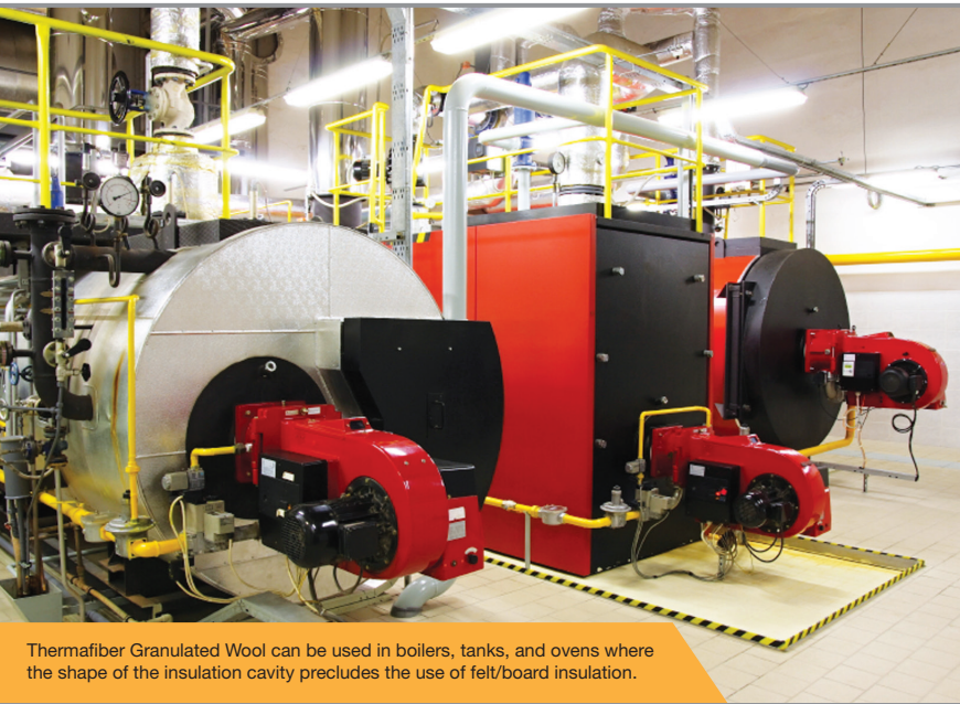
Thermafiber Granulated Wool can be used in boilers, tanks, and ovens where the shape of the insulation cavity precludes the use of felt/board insulation.