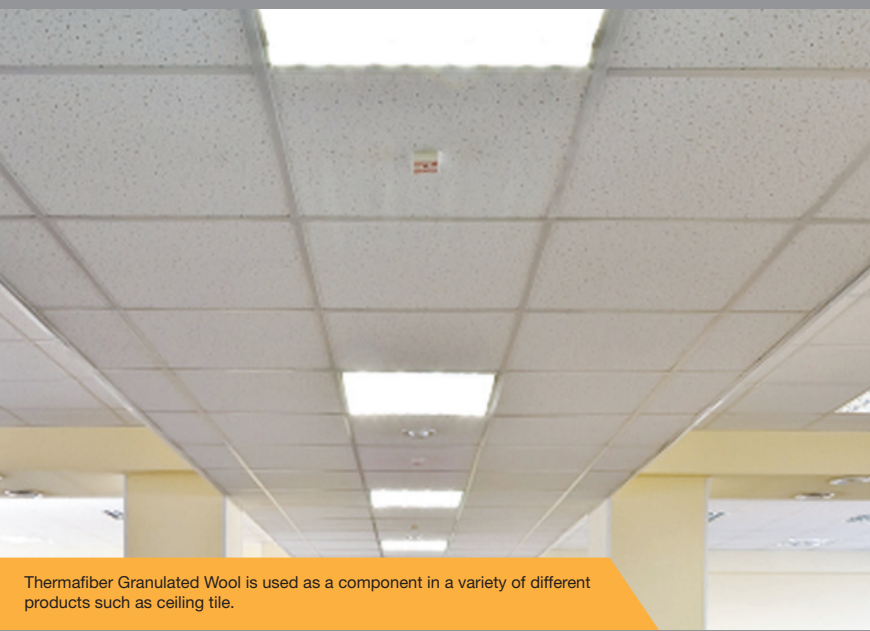
Thermafiber Granulated Wool is used as a component in a variety of different products such as ceiling tile.